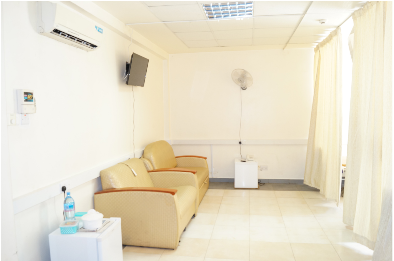
View of the ORCI's private ward