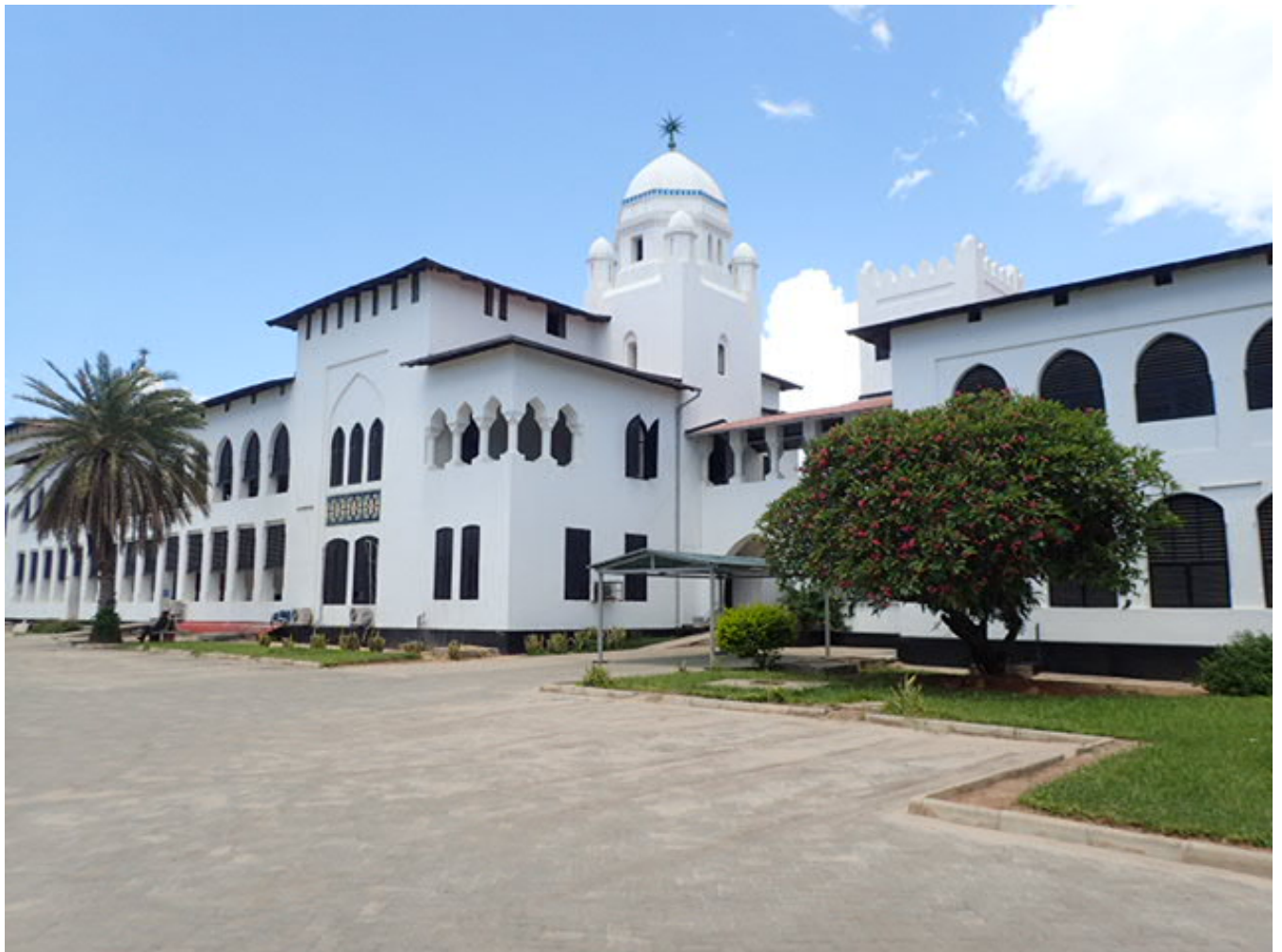
Ocean Road Cancer Institute, Block A back view

This health facility is one of the oldest health institutions in Tanzania having been founded in 1895 by the German colonial government. At its inception the hospital catered for German community only. In 1920, The British colonial government followed the footsteps of their predecessors and continued to provide medical services and facilities for European communities in this hospital, while Africans had to fend for themselves.