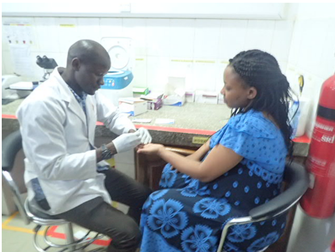
A client during Hepatitis B blood diagnosis