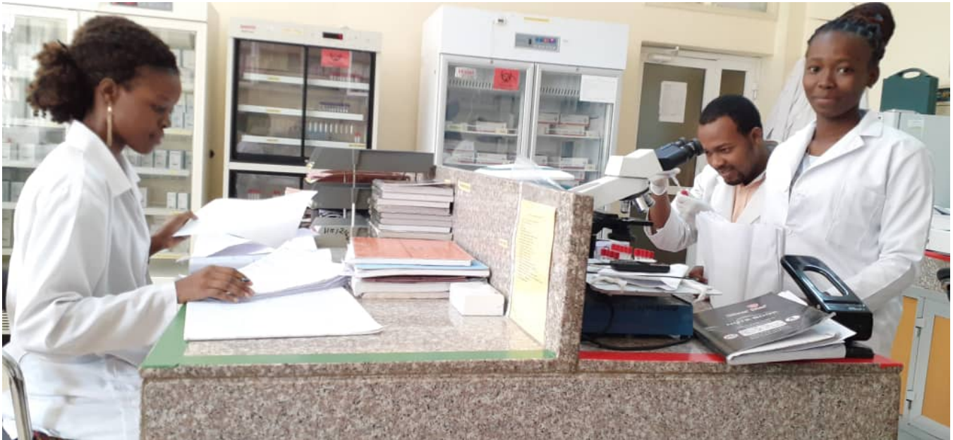
General laboratory technologist during sample analysis and results compilation