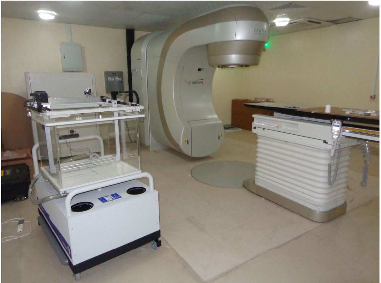
A linear accelerator machine used for external beam radiation treatments for patients with cancer