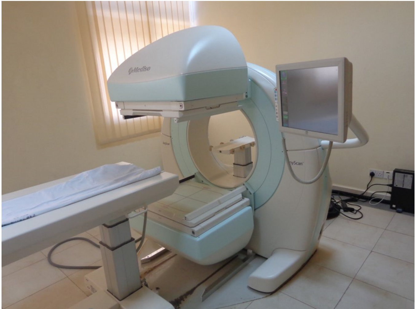
Gamma ray camera a nuclear imaging device at ORCI's Nuclear Medicine section