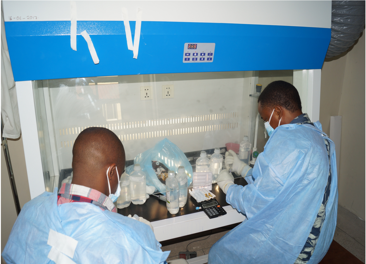
Mixing and preparation of the chemotherapy drips at Chemo ward